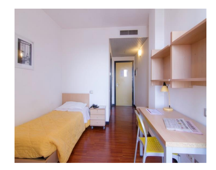
SINGLE ROOM with private bathroom + use of common kitchen

APARTMENT single room €940 € 940 per month